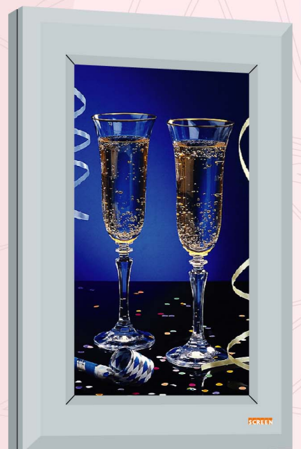
Alpha - A2 PIV (1.5'x2.5')